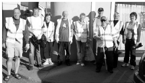
A group of Tuesday night 'pickers' who helped gain first place in the Co. Council anti-litter competition